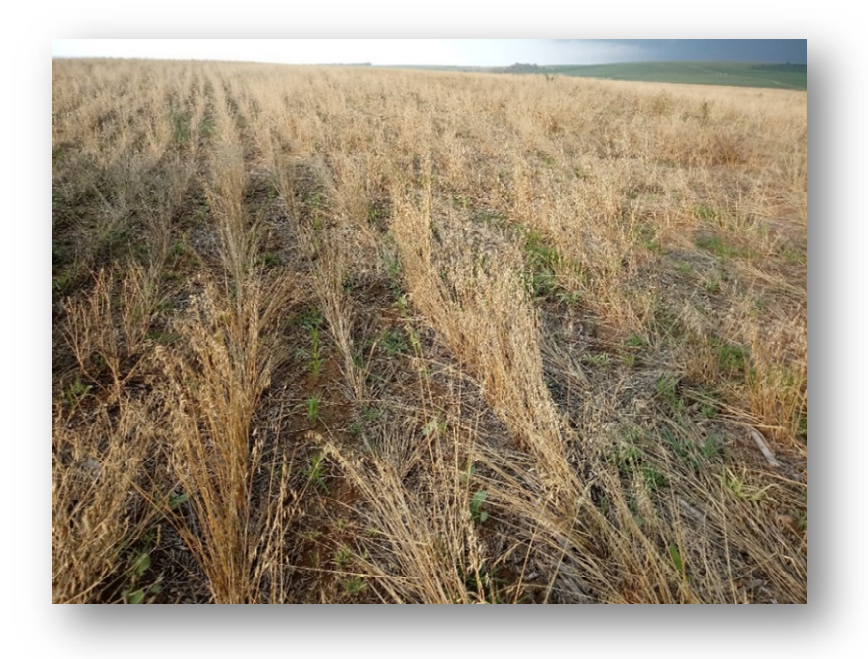
Photo 8.3.2: Late planting of a cover crop mixture into the mulch of black oats

Photo 8.3.2 shows an attempt to lengthen the grazing period, where Callie Mreintjies planted a mixture late in the summer to have good grazing during the lean winter months. This mixture contains more cool season crops that the mixture used in photo 8.3.1.