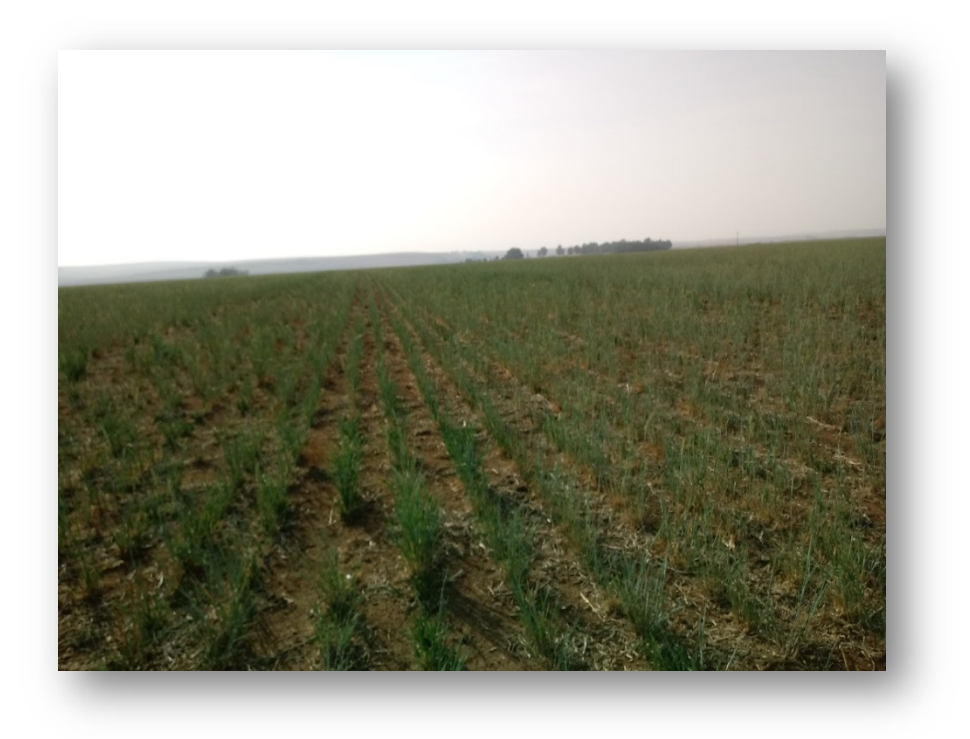
Photo 8.3.4: Regrowth of winter cover crops after the first round of grazing

Photo 8.3.4 give us an indication of the ability of the cool season cover crop's regrowth after grazing. The sward produced enough for a second grazing and had to be terminated using herbicides.