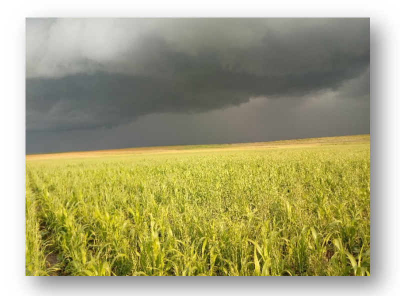
Photo 8.3.1: Summer annual cover crop mixture at Callie Meintjies, Reitz

Photo 8.3.1 shows a good example of a summer cover crop mixture, taken at Callie Meintjies, Reitz. Allthough cool season crops such as sweet clower and radish form part of this mixture, it is dominated by summer legumes and grasses. The color of the sward surgest that nitrogen is needed; the biomass production can be increased by the application of N (40-60N/ha) fertilizer. This will also improve root developmet. Increasing the roots in the soil profile will help to build soi aggregates. Sandy soils are dependent on roots and micro-organism to develop structure, whiles clay soil are more dependent on weather patterns such as drying and wetting.