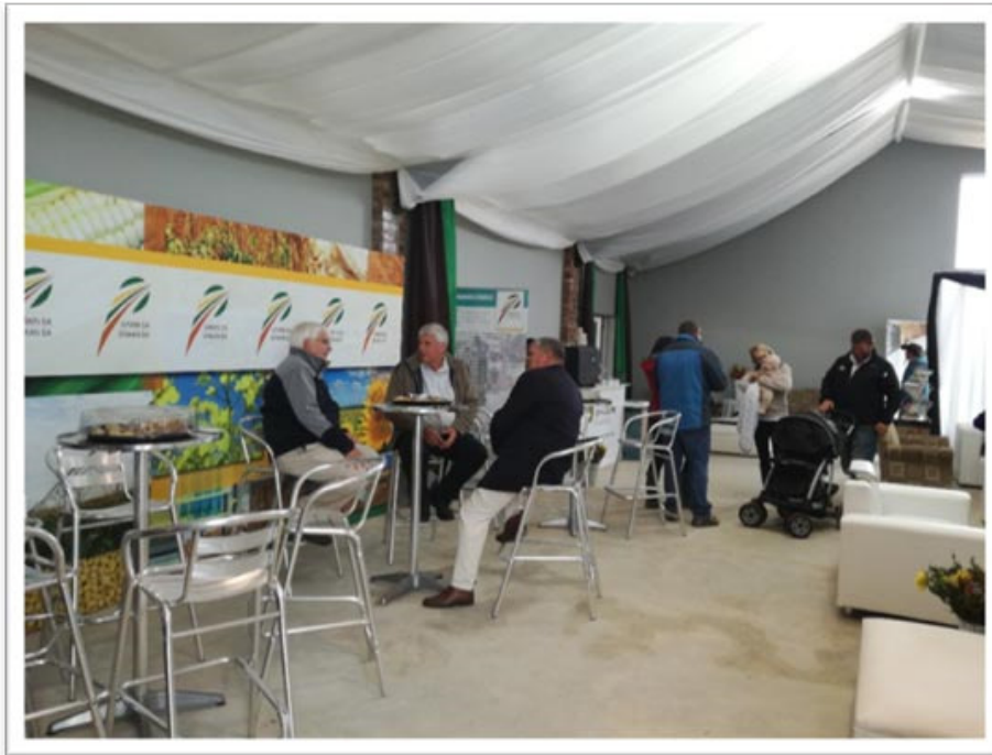
The Grain SA member's area were this year in the ABSA events centre