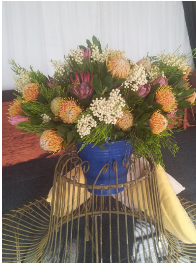
Cape proteas and a warm atmosphere awaits those members of Grain SA who visits the Agri Mega Week 2013.