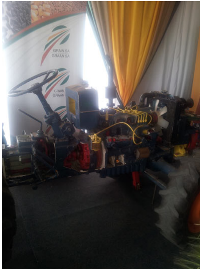
This tractor is used during the Tractor Maintenance Course that is presented free of charge to developing farmers and farm workers.