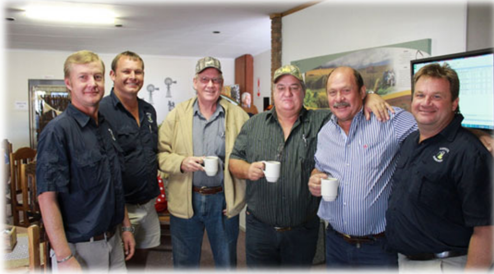
Grain SA members in the Member's Hall

We also wish you good luck with the harvesting that is in process and we pray with our farmers in the Cape that the rain will bring relief so that we can soon see the green fields!