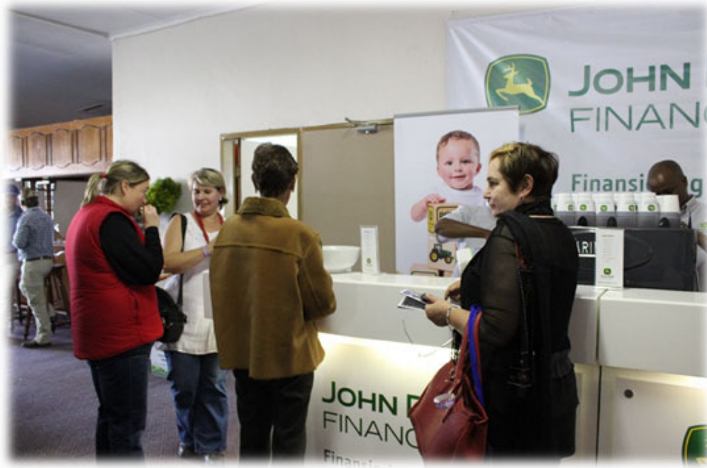
The coffee bar in the Member's Hall was very popular