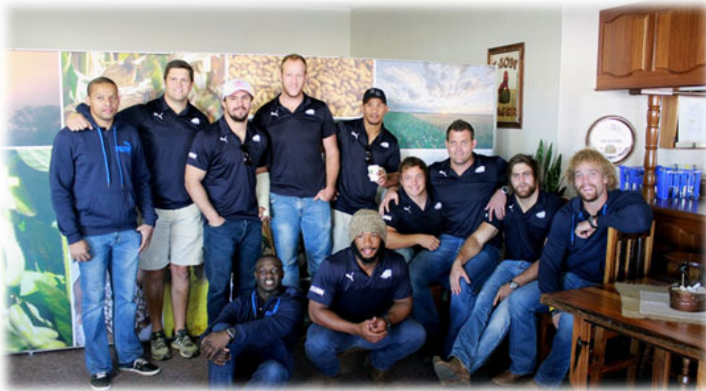
Players from the Toyota Cheetahs rugby team also visited the Member's Hall during NAMPO