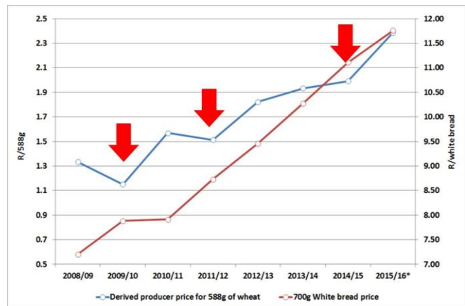
Figure 1: Derived farmer price vs bread price

Overall, raw wheat price movements were in most instances not the main contributing factor to the increase in the bread price, even with the additional import wheat tariff effects.