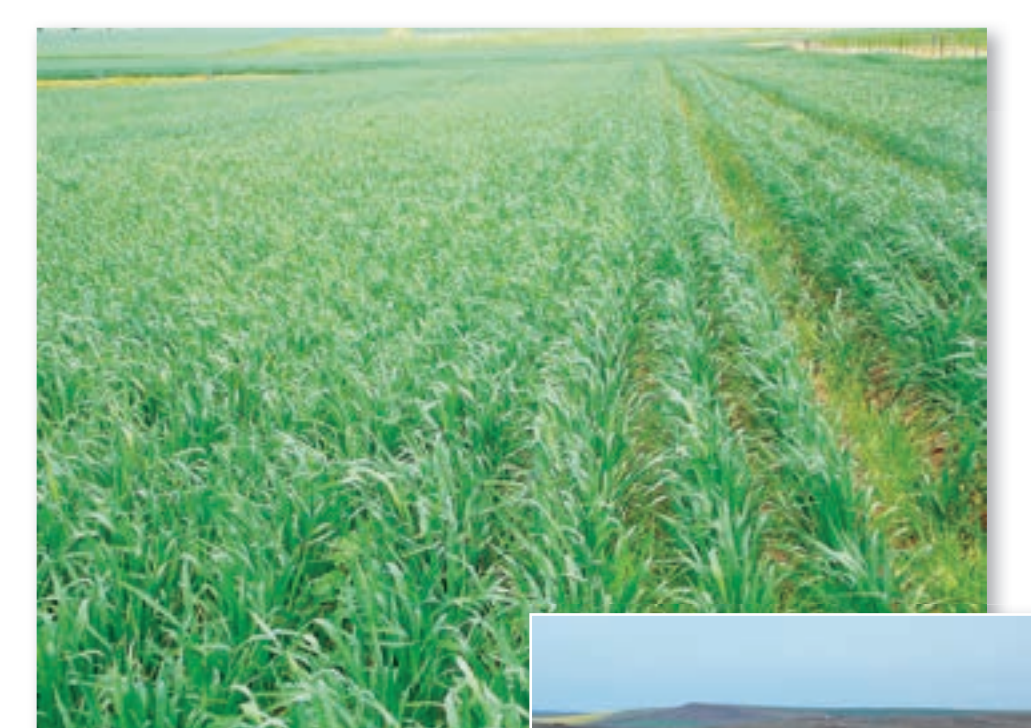
Undesirable weeds in a wheat crop.

Weeds compete with the crop for soil moisture, nutrients, space and light. This competition impairs crop growth and retards development, thereby reducing the crop yield. This competition may cause contamination of the crop seed, a decreased yield or decrease in the quality of the seed crop. The competition offered by