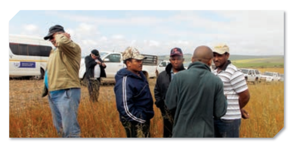
Keep talking to and learning from everyone around you.

any businesses have dedicated procurement departments. They communicate regularly with suppliers to ensure that quality products are obtained at the best possible prices.