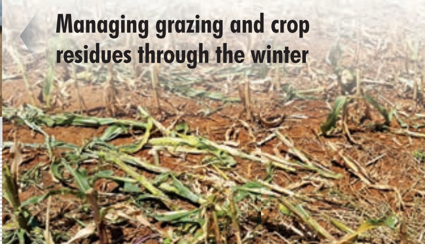
Maize crop residues.

As farmers, we are optimists and we need to lift up our heads after a bad season and plant again. The man that will never harvest is the man who has not planted. Let us make plans, use good modern production practices and plan to plant again in the spring — we have a duty to feed the world and we will continue to do our best! Good luck and I hope that we get good rains during the winter that will fill our soil profile and enable us to hope for a good crop next year.