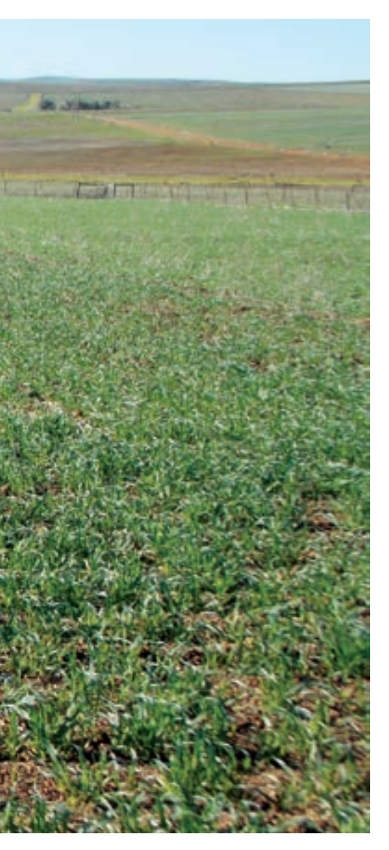
Photo 1: The wheat crop at its most sensitive growth stage in June.