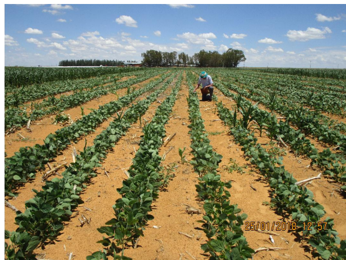
Plate 10: Mono culture maize (left) and rotational soybean (right) on 25 Jan 2018 (Christinasrus).