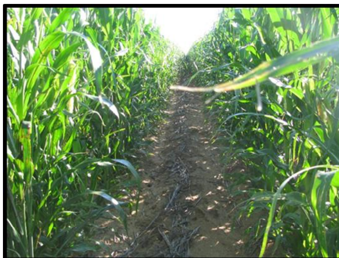
Plate 1: Conventional (ROR) maize on summer cover crop mixture of the 2016/17-season.

After fruitless attempts to get a no-till planter to the site, we eventually accepted defeat and decided to again plant summer and winter cover crop mixtures on the same plots as in the 2016/17 season.