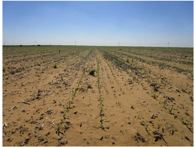
Plate 7: Trial maize stands on 4 Jan 2018: Klein Constantia (left) and Doornbult (right).