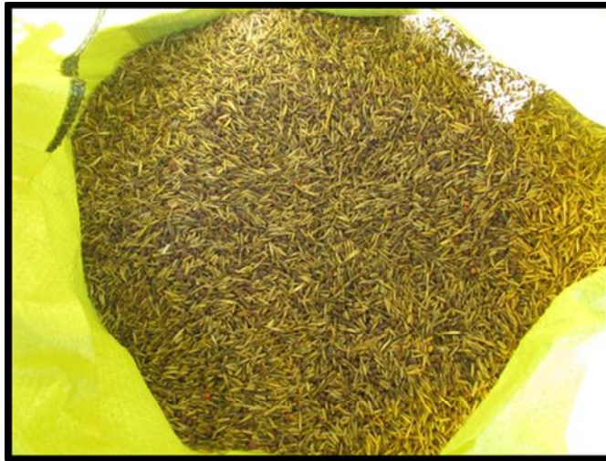
Plate 4: Winter cover crop mixture.

Due to a lack of access to a fine seed planter both treatments were planted using a fertilizer spreader to broadcast the seed. The residues on the surface from the previous crops made it impossible to use implements such as spike tooth harrows to cover the seed with soil so a stalk chopper was used instead.