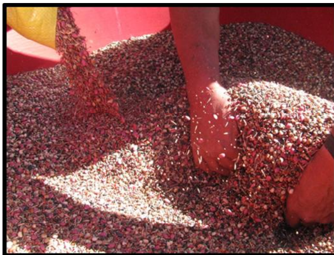
Plate 3: Summer cover crop seed being mixed.

Both summer (10 kg babala; 12 kg sorghum; 6 kg saia; 10 kg cowpea and 10 kg lablab) and winter cover crop mixtures (15 kg rye, 15kg black oats, 10kg hairy vetch and 250g of tillage radish) were planted. The summer and winter crop mixtures were planted on 1.2 and 0.75 ha, respectively. Fertilizer (LAN) was broadcast at 56 \text{ kg N ha}^{-1} on each of the areas. Barenbrug provided the seed in both instances and the summer cover crop mixture was sponsored for which we are very grateful. The summer cover crop mixture was planted on the 9 th of January while the winter cover crop mixture was planted on the 21 st of February. Plates 3 and 4 represent images of the mixtures used.