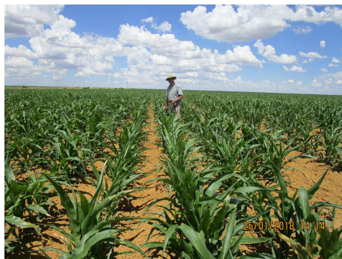
Plate 12: Maize stands at Springboklaagte (left) and Doornbult (right) at 30 000 and 25 000 plants ha -1 on 24 and 25 Jan 2018.