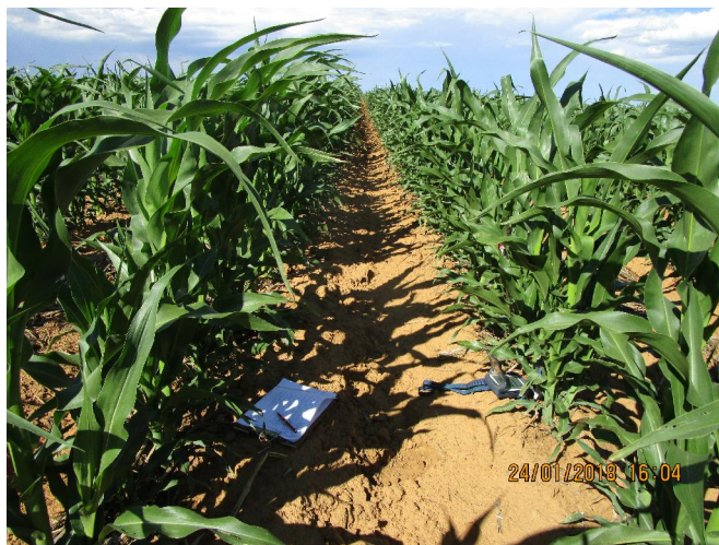
Plate 9: Maize stand on 24 Jan 2018 following winter cover crop mixture (Deelpan).