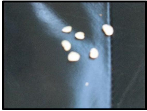
Plate 15: Summer cover crop mixture (left) and damaged cowpea seeds (right).