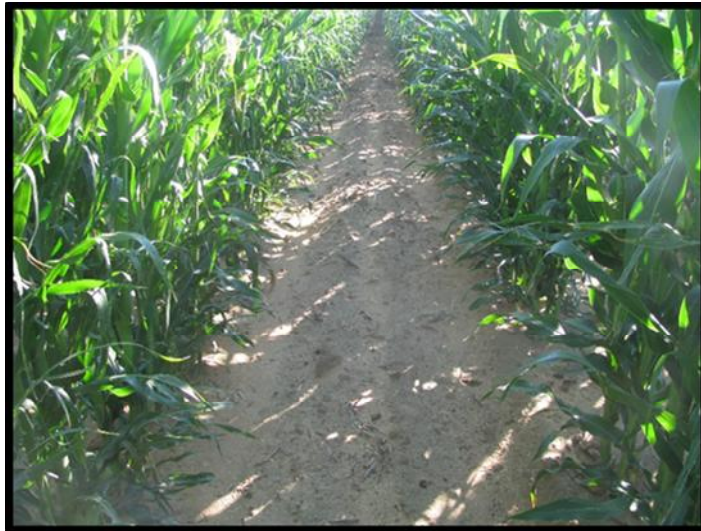
Plate 2: Conventional (ROR) maize on winter cover crop mixture of the 2016/17-season.

Both summer (10 kg babala; 12 kg sorghum; 6 kg saia; 10 kg cowpea and 10 kg lablab) and winter cover crop mixtures (15 kg rye, 15kg black oats, 10kg hairy vetch and 250g of tillage radish) were planted. The summer and winter crop mixtures were planted on 1.2 and 0.75 ha, respectively. Fertilizer (LAN) was broadcast at 56 \text{ kg N ha}^{-1} on each of the areas. Barenbrug provided the seed in both instances and the summer cover crop mixture was sponsored for which we are very grateful. The summer cover crop mixture was planted on the 9 th of January while the winter cover crop mixture was planted on the 21 st of February. Plates 3 and 4 represent images of the mixtures used.