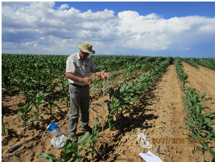
Plate 5: Syphoning a water table sample on 24 Jan 2018 at Deelpan.

Transect soil sampling of Trial 1 by OMNIA, Drr Beukes and Nel was scheduled for 22 March 2018. Due to incessant rain on the 22 nd , the sampling has been moved to early April. The maize stand will be sampled on the row and between the rows, while random samples will be taken on the summer and winter cover crop lands. For soil fertility analysis, samples will be taken at 0-200 and 200-500 mm depth intervals, respectively. For soil organic C (SOC) analysis, samples will be taken at 0-50, 50-100, 100-200 and 200-400 mm depth intervals, respectively, on the experimental lands, as well as on an adjacent undisturbed grass stand. Standard soil fertility analyses (e.g. pH, P, cations, \text{NH}_4^- and \text{NO}_3^- -N ) will be performed, as well as Walkley-Black analyses for SOC.