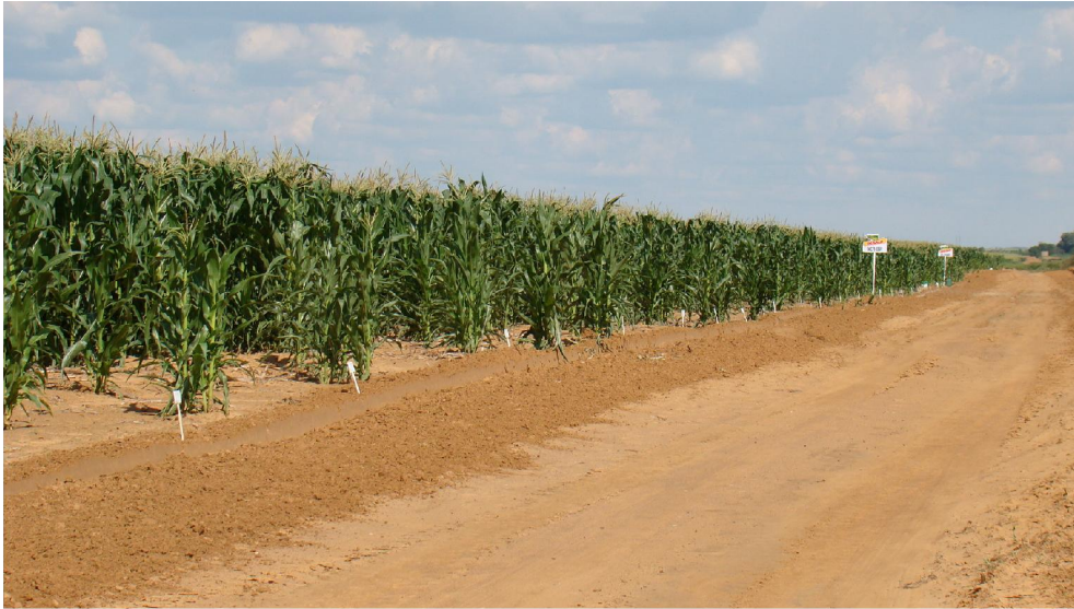
Plate 13: Maize plant density trial at Springboklaagte on 22 Feb 2018.