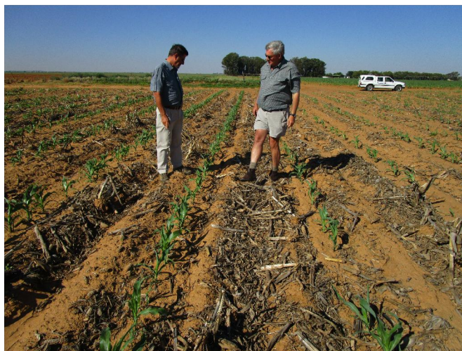
Plate 8: Trial maize stand on 5 Jan 2018 (Springboklaagte).