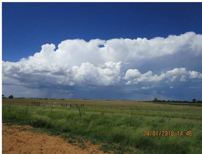
Plate 6: Promising rain clouds over the study area on 24 Jan2018.