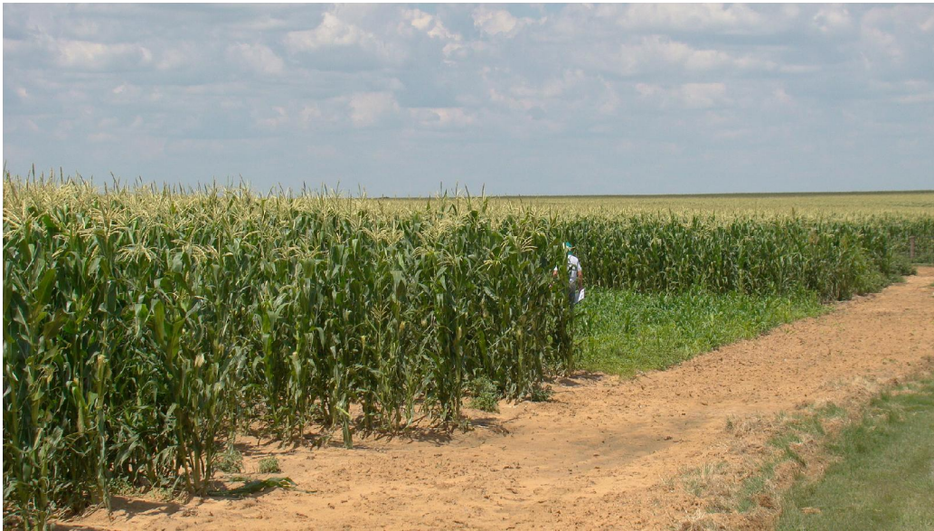
Plate 14: Maize stands on cover crop trial at Deelpan on 23 Feb 2018.