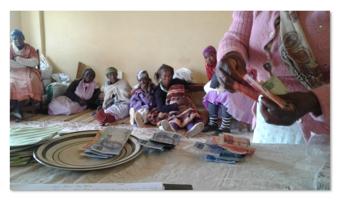
FIGURE 5: EZIBOMVINI, UKUZAMA FERTILISER SAVINGS GROUP

There are two savings groups in Ezibomvini, one for general household needs and another (Ukuzama) for the purchase of fertiliser. The groups have 23 and 10 members respectively. In both groups, the payment period is 6 months rather than the prescribed 4 months. The reason was that most members would not be able to pay back the loan in 4 months as the period was too short. Secondly, the group saves between R100 and R 300 a month instead of R 100 to R500, because they could not afford to save more than R 300 a month. In the first group, all three keys are kept by one person as one of the key bearers left the group. The members of the learning groups agreed to have two separate groups as there were people who wanted to join the savings group but weren't under the CA programme. The groups are in their second year of operation.