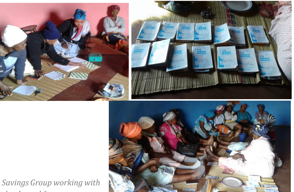
Right: Nkandla Savings Group working with the new savings books and forms