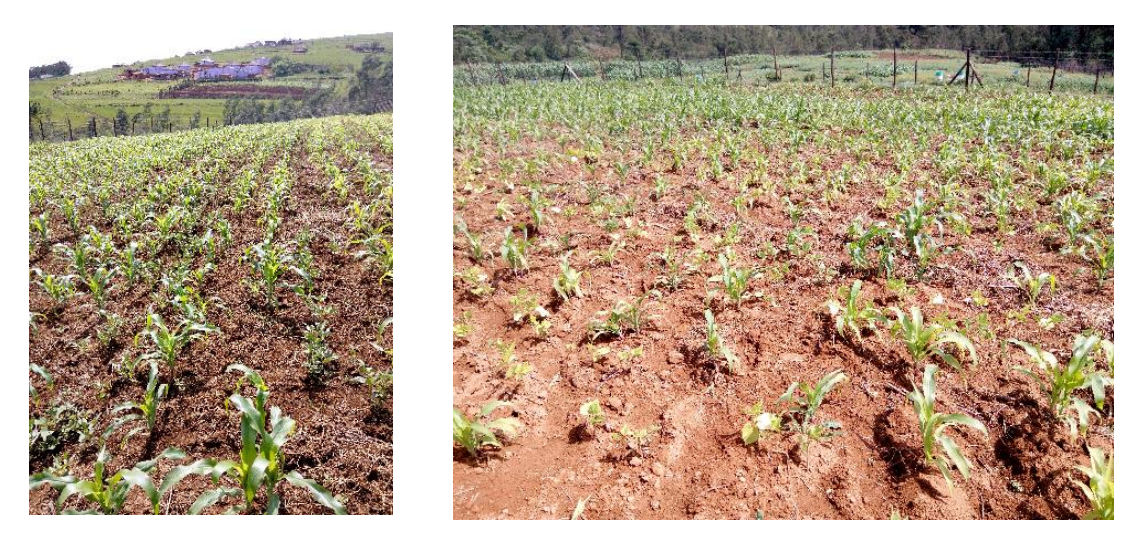
Above left and right. Crop growth monitoring in December 2016 showed fastidious weeding by participants. Germination was around 90% for maize, but much lower for beans and cowpeas. Growth was a bit disappointing- with evidence of run off and yellowing due to subsequent lack of nutrients.