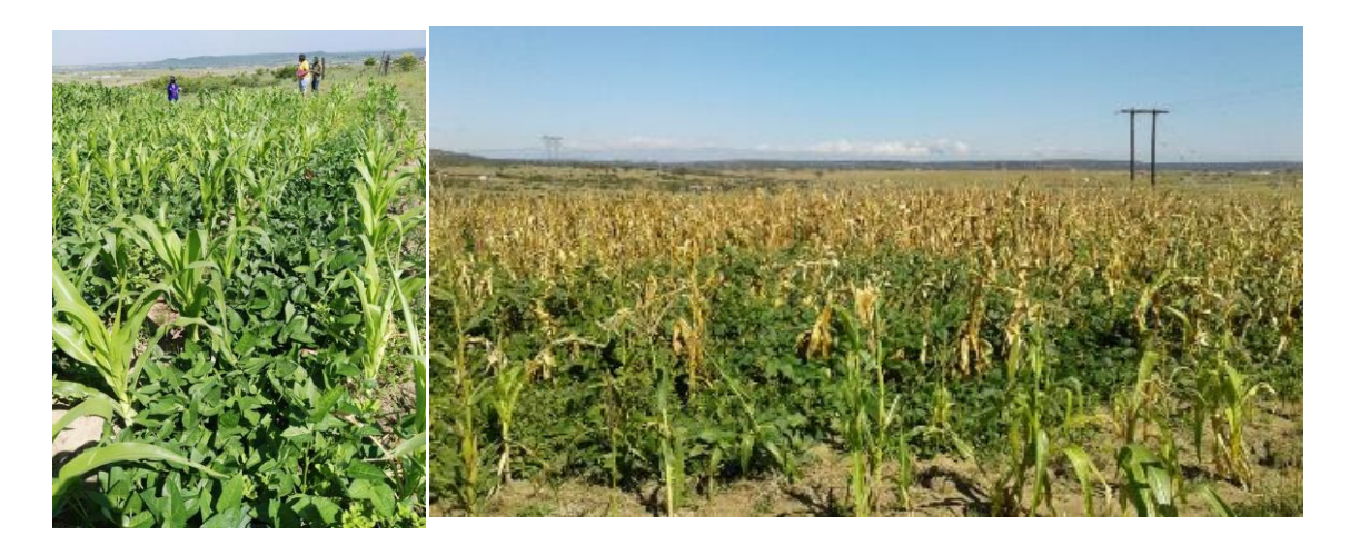
Far left and left: A view of their CA trial plot in January and April 2017. Cowpeas grew very well. Beans, although with patchy germination, grew well subsequently and a reasonable yield should be realised. Maize growth was reasonable