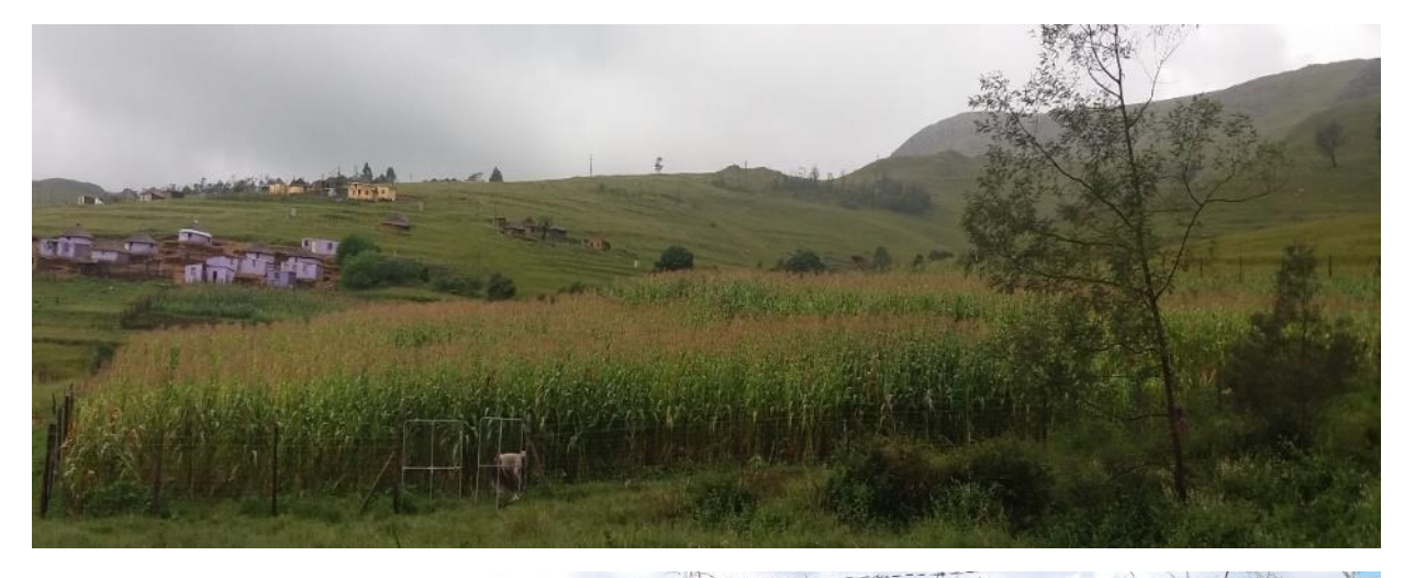
Above and right: Growth of the trial plot in Nkandla in March 2017.